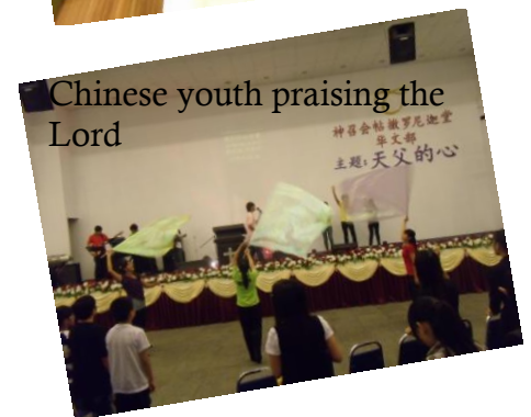
Chinese youth praising the Lord

Word to World Ministries Bank: First National Bank Account No: 62061360336 New Park Branch code: 231002 Swift Code: FIRNZAJJA436